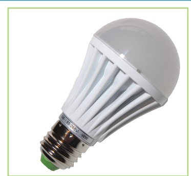
Switching to LED lights can save 80 percent of the electricity cost of operating an incandescent bulb.